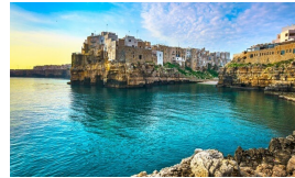
SEA - 20 MINUTES