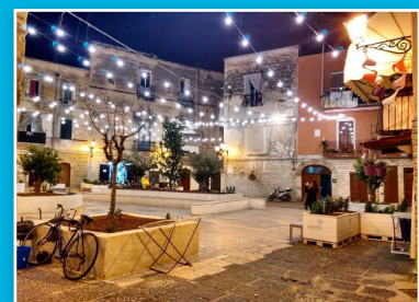
Piazza degli Innamorati