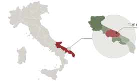
TURI ON MAP